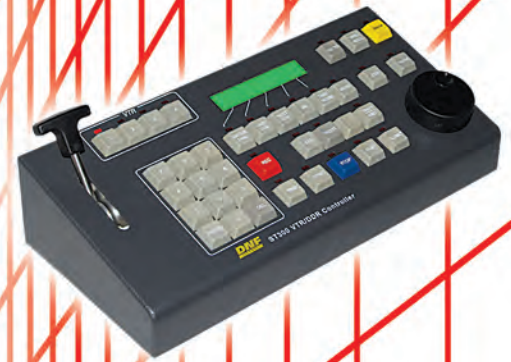
ST300 Slow Motion Controller

Achieve even more power by combining the DMAT Sports Controller with a multi-channel DDR or video server that supports simultaneous record and playback. With control of up to four record and four playback channels, you can create cue points from multiple cameras to provide different angles of the same event, and create playlists of cue points, all with only a few key strokes. To create an exciting visual sequence, play out a sequence of cue points, one seamlessly following the other.