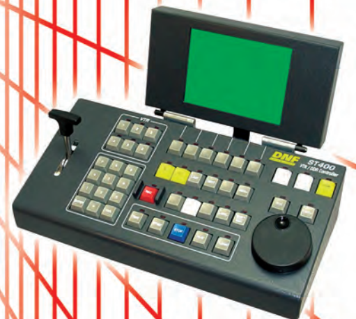
DMAT Sports Controller