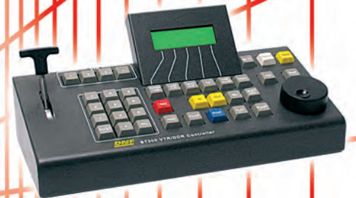
ST304 Slow Motion Controller