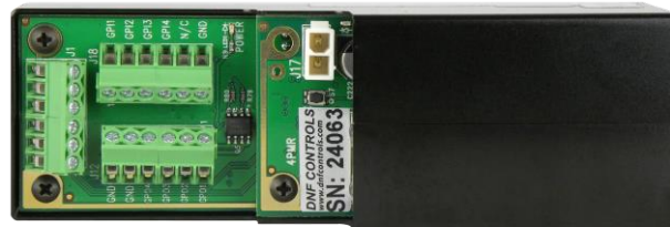
EB-44, EB-42, EB-41 & EG-4