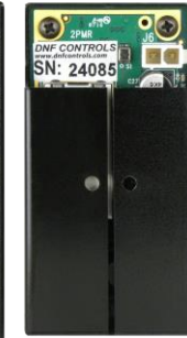
EB-22 EB-22, EB-21